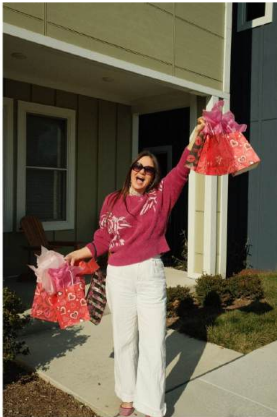
Taking time to enjoying the new fire pit addition in the courtyard and as always showing some love for our residents with a special Nord's cookie delivery for Valentine's Day.