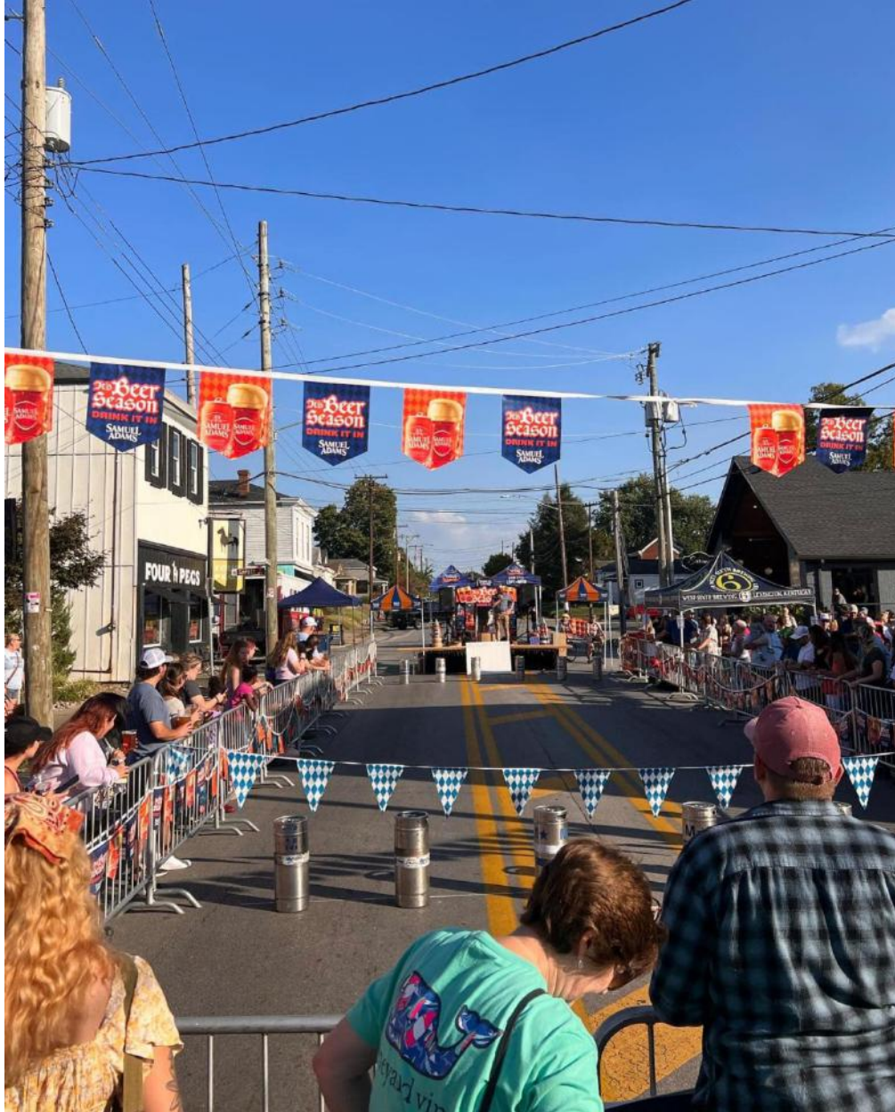
Germantown Oktoberfest takeover of Goss Ave.