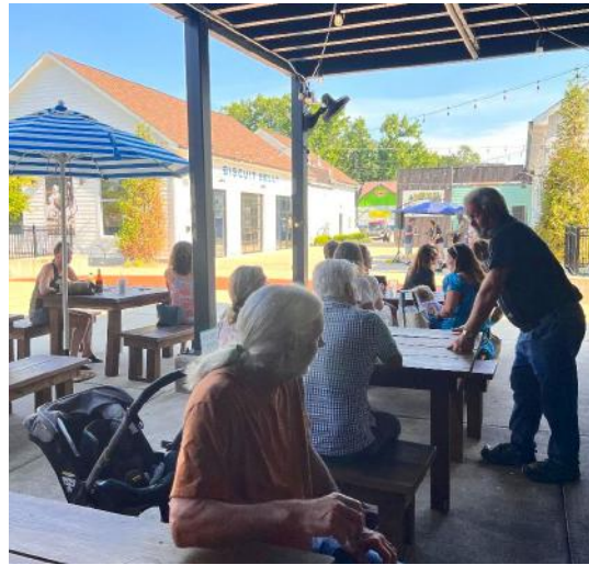
UA staff enjoying an afternoon together on the Colonial Garden's patio listening to "This, That, & the Other".