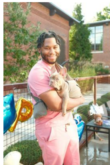
End of Summer Pooch Plunge at the GML Pool