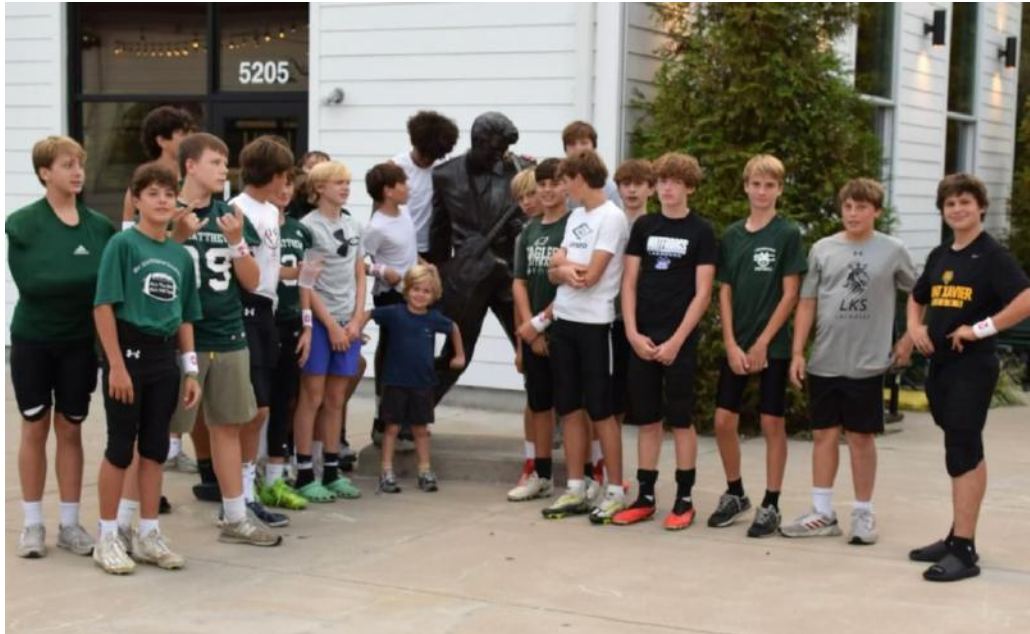
Holy Trinity football team getting in on the fall fun as they hang with Elvis.

Join us and shop small for Small Business Saturday November 25th.