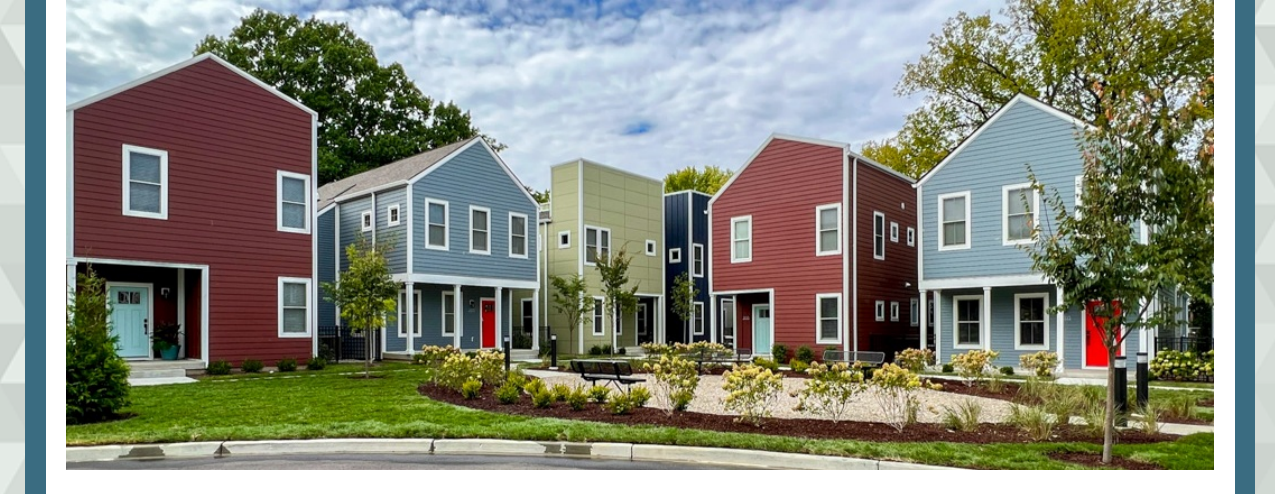
Spring is around the corner and Swiss Village continues to grow its community of residents.