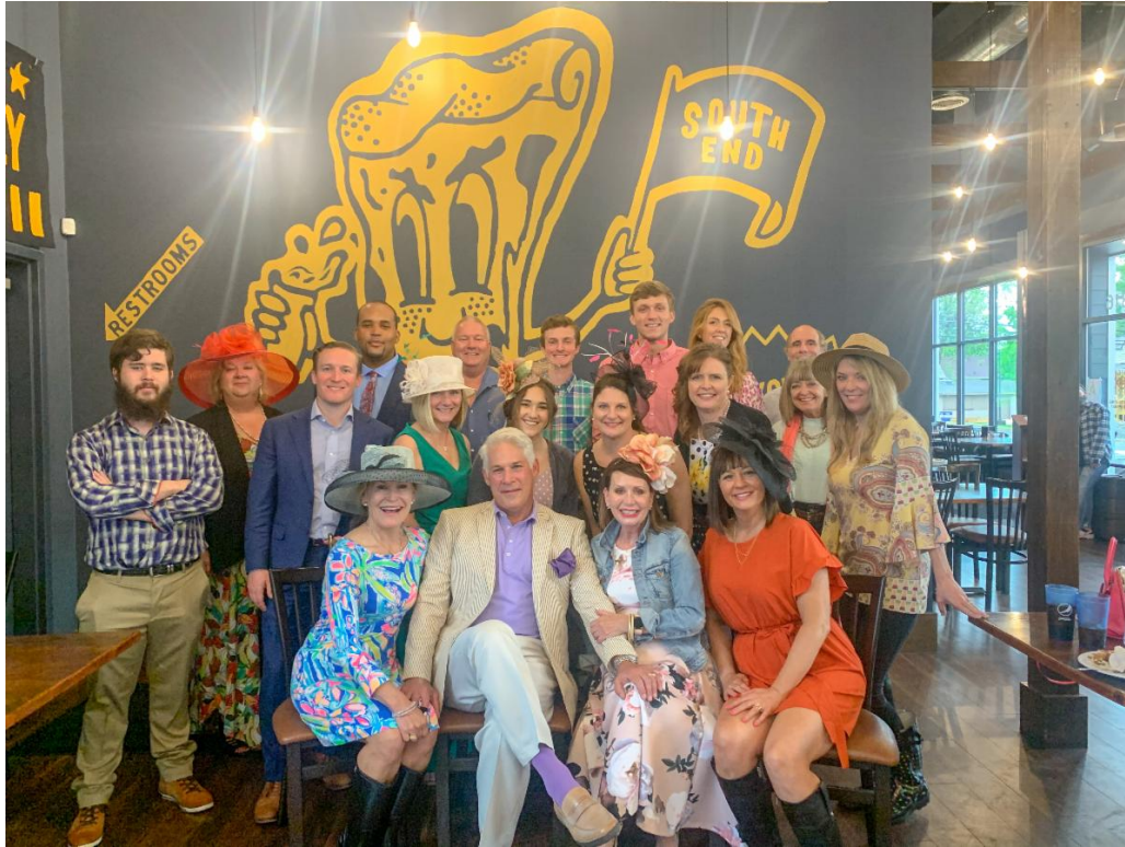
Underhill Associates team all dressed up for Thurby 2021