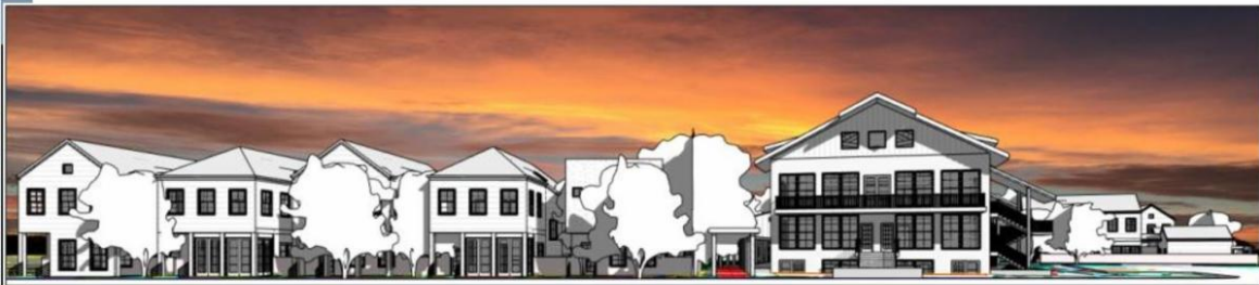
View from Lynn Street