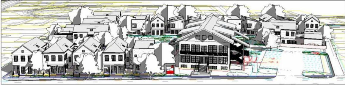
Birdseye view looking north - Lynn Street frontage